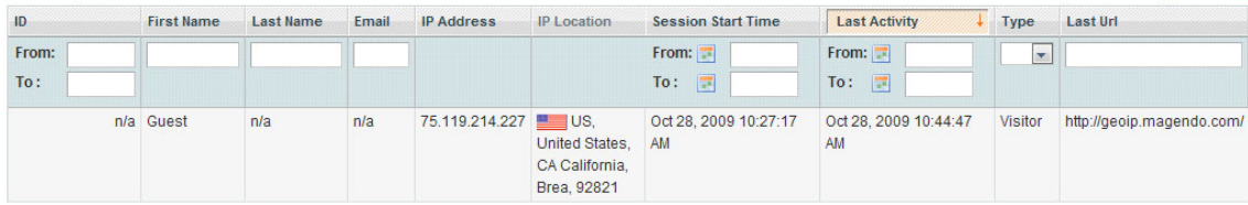
Online Customers Grid

Page of 1 pages | View per page | Total 1 records found